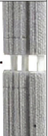
No loose parts stacking system