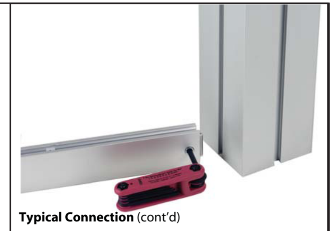
Typical Connection (cont'd)

Most horizontal extrusion connections have a patented expandable lock. This lock inserts into the groove of an opposing extrusion. Tightening the lock with the Hex Key Tool expands the lock and creates a strong positive connection.