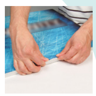
TSP 10 Frame