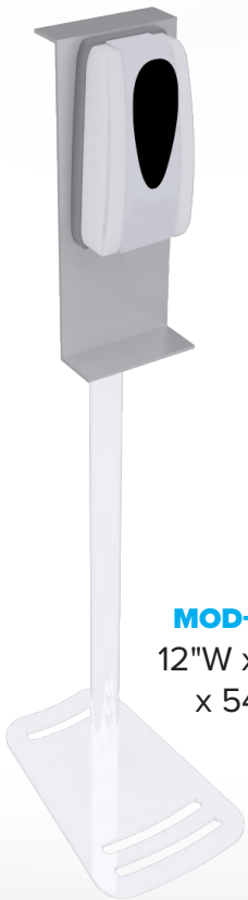
MOD-9001 12"W x 18"D x 54"H