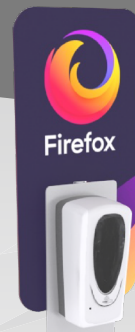
MOD-9007 10"W x 10"D x 24"H