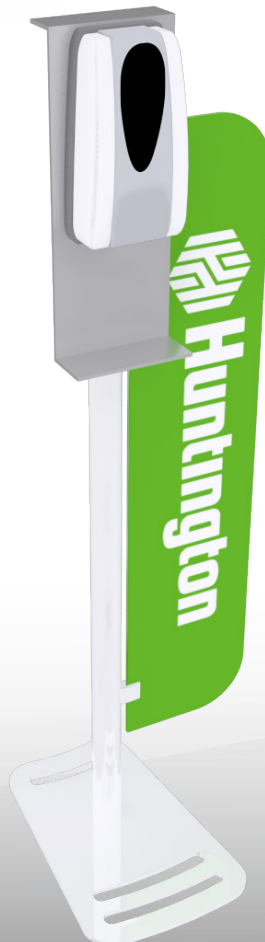
MOD-9001 W/GRAPHIC 16"W x 18"D x 54"H