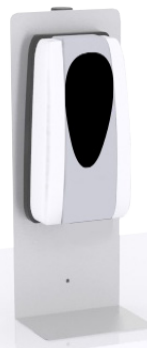
MOD-9007 10"W x 10"D x 24"H