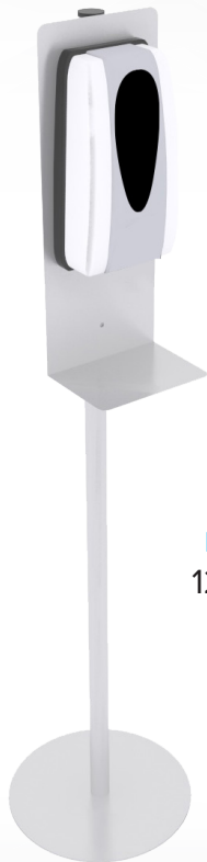
MOD-9004 12"W x 12"D x 50"H