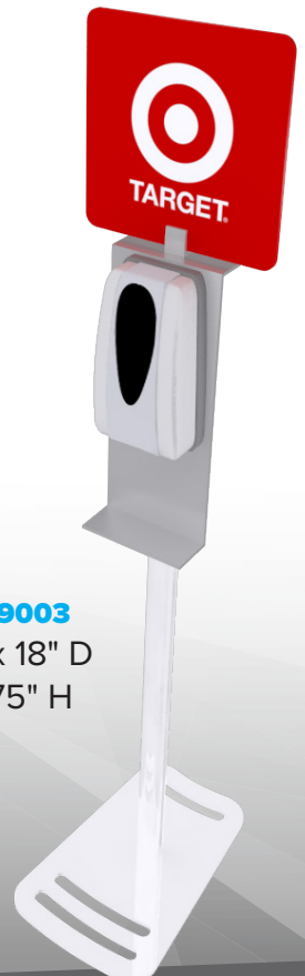
MOD-9003 12" W x 18" D x 59.75" H