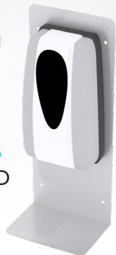
MOD-9005 7"W x 3.5"D x 18" H